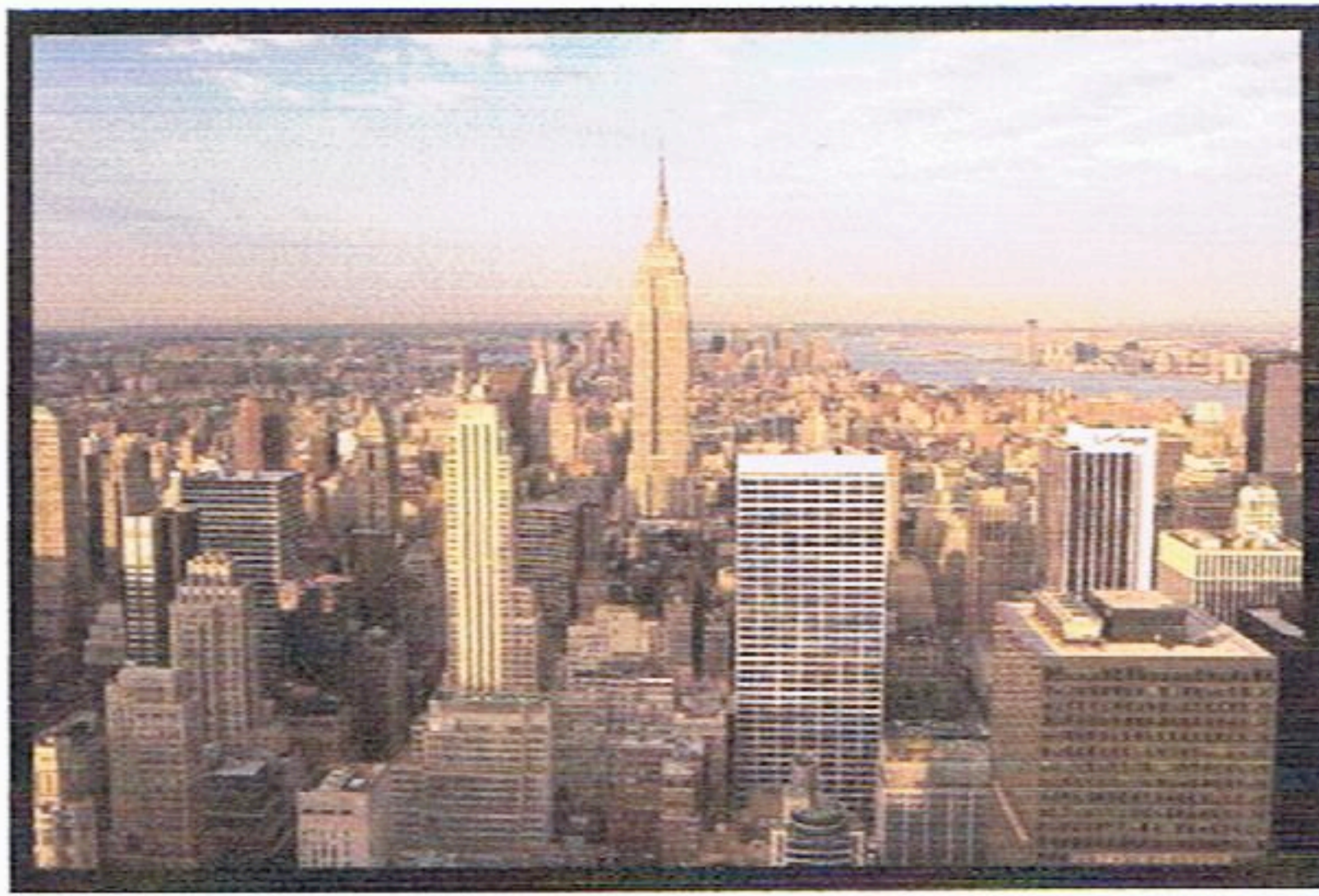
NEW YORK SKYLINE